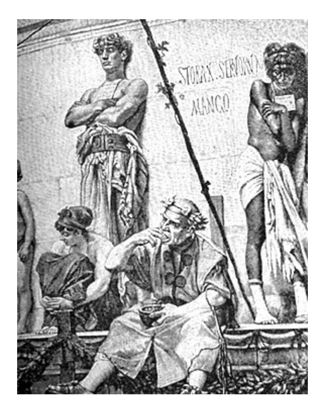
Mark of the Beast